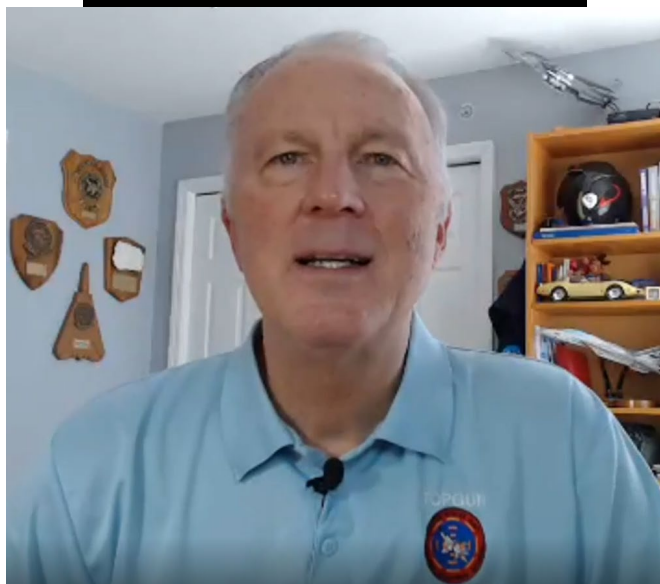
Photo from Zoom