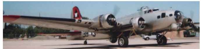
EAA's: B-17G Aluminum Overcast Reported and photos by Peggy Sue Bassett