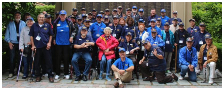
A group photo by Warner Bros. in front of the Warner Bros. memorial wall of the employees that served in World War II.

limited to the size that the trams allocated for our tour could hold.