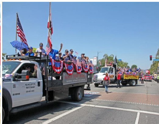
The trucks with over 40 members forming up