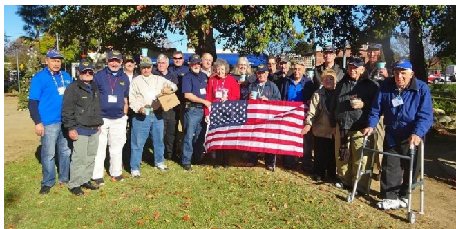
By Bill Tapp