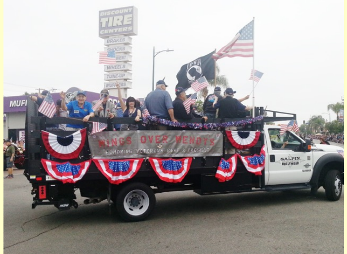
Starting down Sherman Way