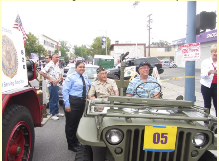
Art before the parade

Submit all articles before the last Wednesday of the month to Wingsnews@gmail.com