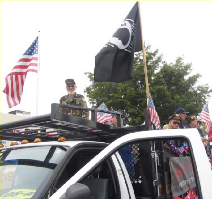
Our Flags On High