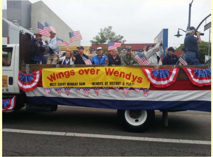
Jacobi truck following the Galpin truck