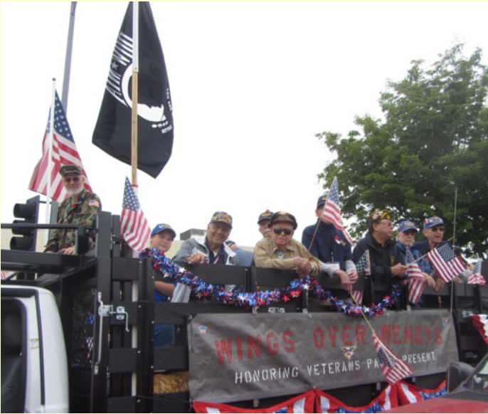
Our New Banner